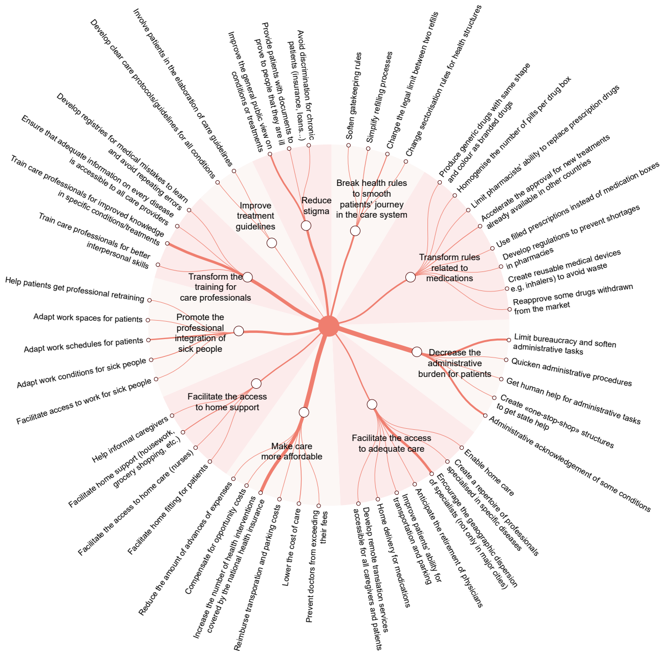
Figure 3 Areas for improvement at the health system level. Line thickness represents the number of participants who elicited the idea.

significantly augmenting our data, this collective intelligence approach reinforced patients' participation in research: patients were informed about the progress of the analysis and were involved in its finalisation. 31 Second, the impact of investigators' preconceptions on the analysis was reduced by (1) the independent analysis of data by multiple researchers, each supplementing and/or contesting others' statements, and (2) the triangulation of our findings by patients themselves. 42 Finally, our study included a large sample of participants with diverse diseases, education level and place of residence. This diverse sample enabled the collection of a comprehensive list of areas for improvement and an abundant number of patients' ideas.