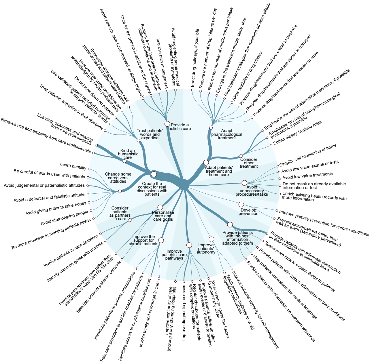
Figure 1 Areas for improvement at the consultation level. Line thickness represents the number of participants who elicited the idea.

areas for improvement were identified. Thus, our study represents a comprehensive mapping of the aspects of consultations, hospitals/clinics and the health system that require change, according to patients (online supplementary appendix 6).